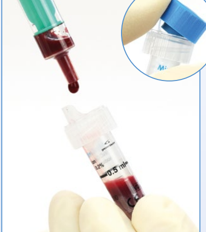
Please note that the MiniCollect® coagulation tube is intended only for use with venous blood.