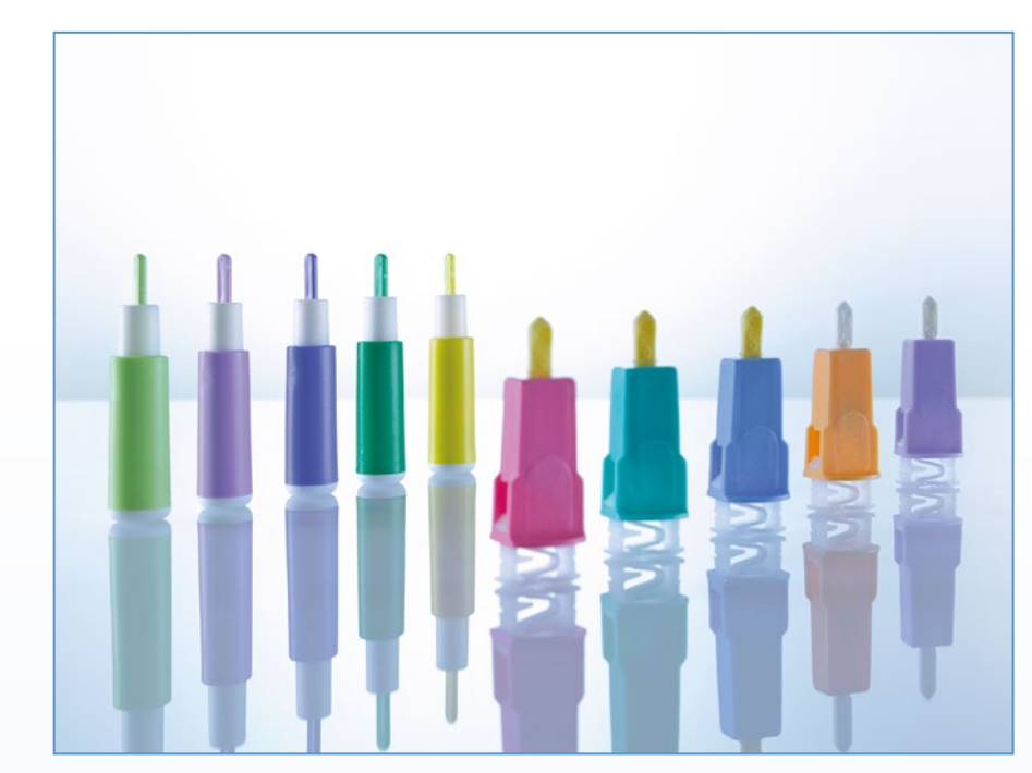
Lancets are colour-coded for easy identification of puncture depth and application.

The safety mechanism ensures that the blade/needle is automatically retracted after the puncture and is safely enclosed within the plastic housing. In particular when dealing with our youngest patients it is imperative that the procedure be as gentle as possible to avoid causing unnecessary anxiety. The safety mechanism means that the blade/needle is hidden from view, allowing the blood collection to take place in a more relaxed atmosphere for all concerned.