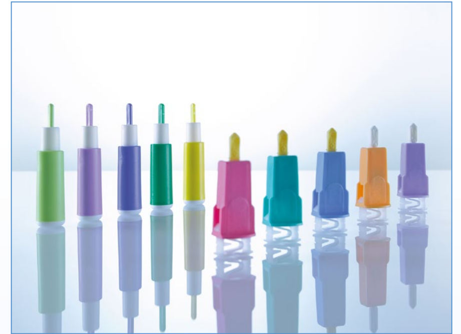
Lancets are colour-coded for easy identification of puncture depth and application.

The safety mechanism ensures that the blade/needle is automatically retracted after the puncture and is safely enclosed within the plastic housing. In particular when dealing with our youngest patients it is imperative that the procedure be as gentle as possible to avoid causing unnecessary anxiety. The safety mechanism means that the blade/needle is hidden from view, allowing the blood collection to take place in a more relaxed atmosphere for all concerned.