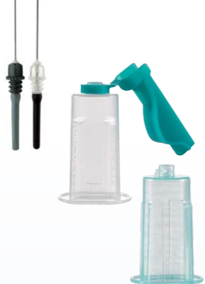
VACUETTE QUICKSHIELD or Standard Tube Holder