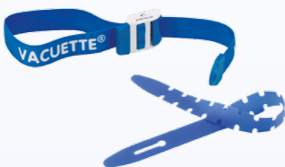
VACUETTE Tourniquet or VACUETTE Super-T